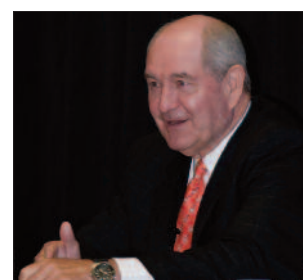
Governor Sonny Perdue of Georgia, the 2006-2008 SREB Chair, led the SREB Committee to Improve High School Graduation Rates and Achievement.

SREB will assist states by reporting state progress in implementing these essential policies.