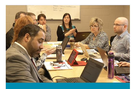
RTI teams meets monthly to review student progress.

Tier I is classroom instruction. SCS has a strong focus on teaching and learning to ensure high-quality instruction at every level. The district believes most students will be successful in Tier I.