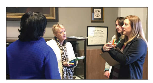
Alamance-Burlington academic coaches debrief after learning walk.