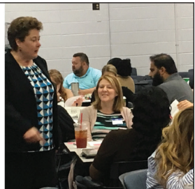
Jefferson County Public Schools new teacher math training

Year 4: 2017-18 — In phase four, the goal was to sustain and grow. Ten new elementary schools began implementing the math strategies in grades three through five, and seven new high schools were brought on board. The emphasis was still on incorporating MDC strategies as part of daily practice.