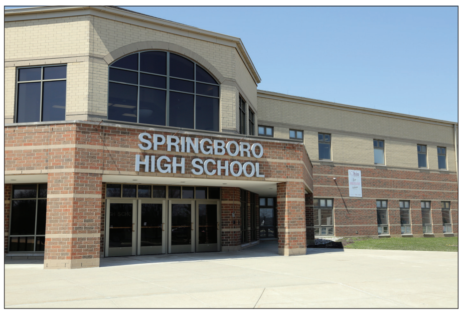
Springboro High School, Springboro, Ohio

From 2013 to 2019, Springboro High School not only doubled its Advanced Placement course offerings, it also doubled AP enrollments. The percentage of students who passed their AP exams with a 3 or higher also increased, from 77% in 2013 to 82% in 2019.