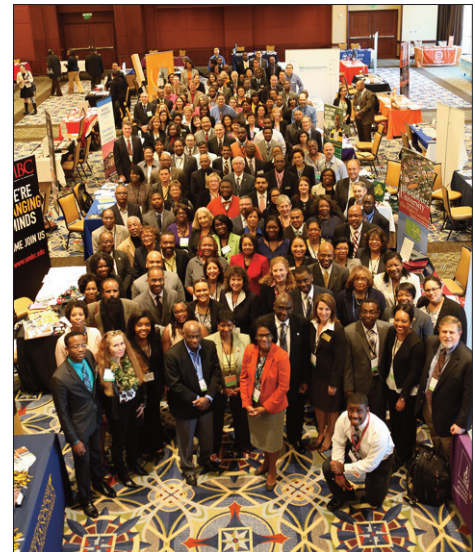
Recruiters at the 2014 Institute.

Institute graduates were also featured on Inside Higher Ed! Check it Out: Missing Minority Ph.D.s ( https://www.insidehighered.com/news/2014/11/03/study-finds-serious-attrition-issues-black-and-latino-doctoral-students )