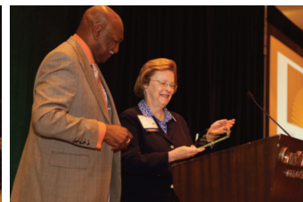
Sloan Special Award