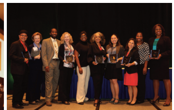
Mentors of the Year