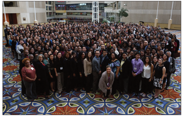
Attendees at the 2014 Institute on Teaching and Mentoring in Atlanta, Georgia.

Be sure to take a look at the presenter session handouts; they all have some tips and resources that you will find useful in the new year. If you are interested in submitting Institute proposals and requests you can do so here ( http://instituteregistration.sreb.org/SessionProposalsAndRequests/ ).