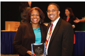
Extra Mile Award