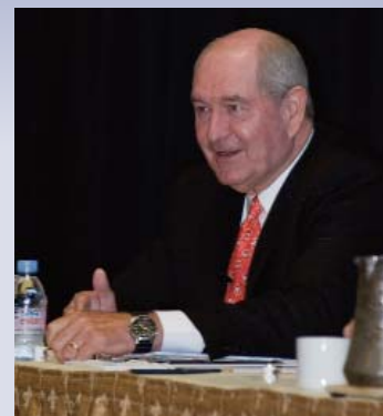
Governor Sonny Perdue, Georgia, chair of SREB in 2008, speaking to the SREB Annual Meeting in Boca Raton, Florida

“We could easily raise graduation rates by allowing students to meet very minimal academic requirements. But that won't get us where we need to go. Using the same logic, we could raise achievement by allowing our lowest-level students to leave school. Again, that's not what we want. That's why a two-pronged approach is crucial. Our challenge now is to move beyond requirements that high schools improve test scores. We need to set our expectations even higher for the levels of skill we expect students to learn. And very importantly, we need to make high school graduation a major priority — like never before in our states.”