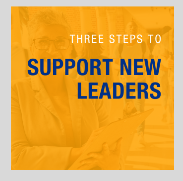
Just because someone is now in a leadership position does not mean that they do not still need support. In this post, we