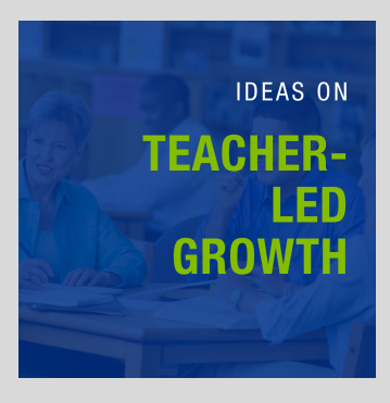
Just like you ask your teachers to give students ownership in their own learning, you should give teachers the same growth