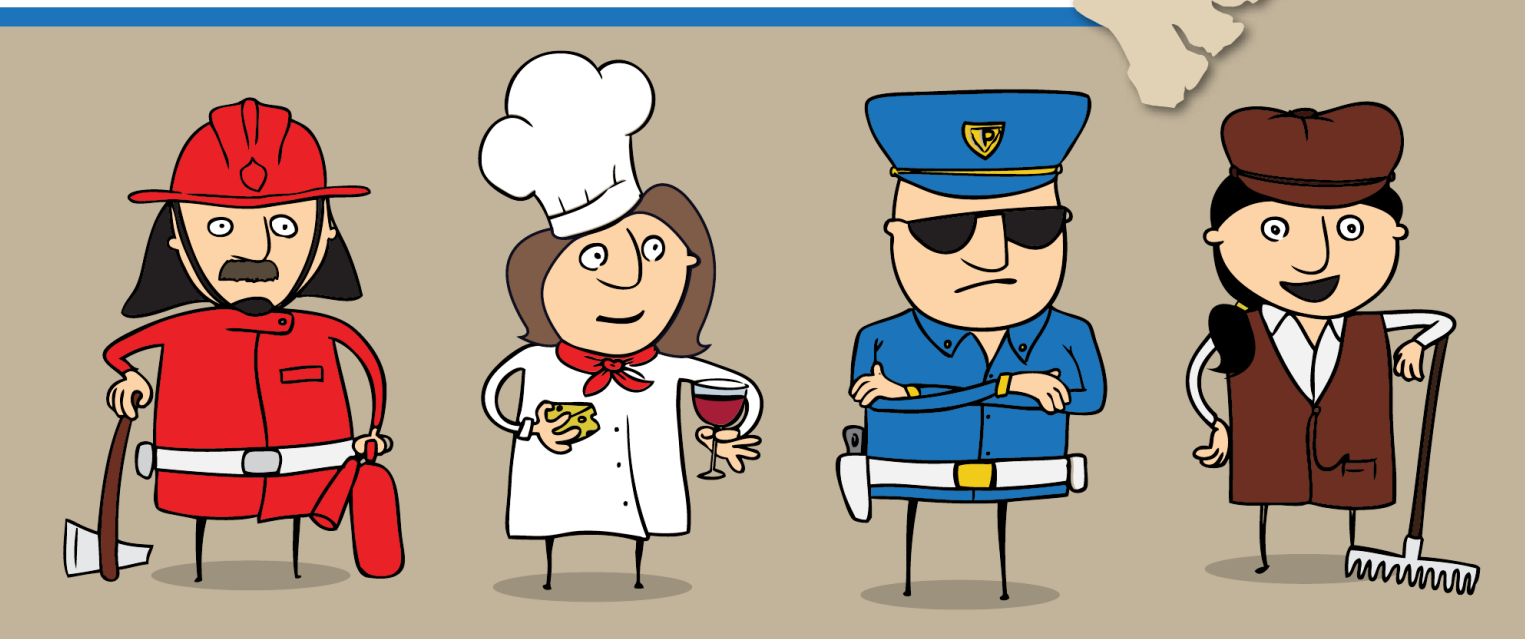
ILLUSTRATION BY ISTOCK.COM