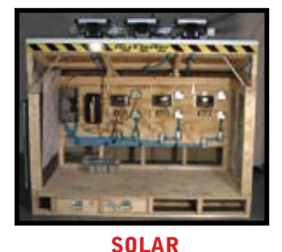
MADE IN U.S.A.